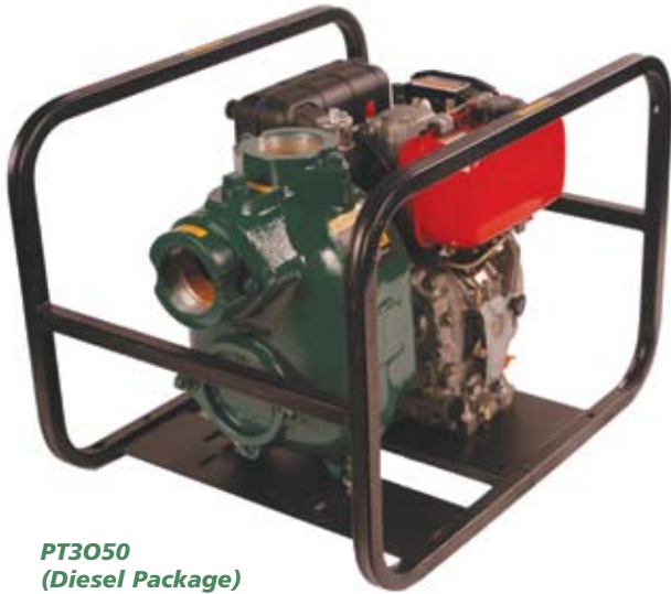
PT3050 (Diesel Package)

When pumps are required to Perform, Pioneer Pumps stand up to the challenge.